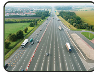
FOUR LINE HIGHWAY