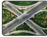
OUTER RING ROAD