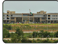
RR COLLECTOR OFFICE