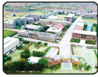
GURU NANAK INSTITUTIONS