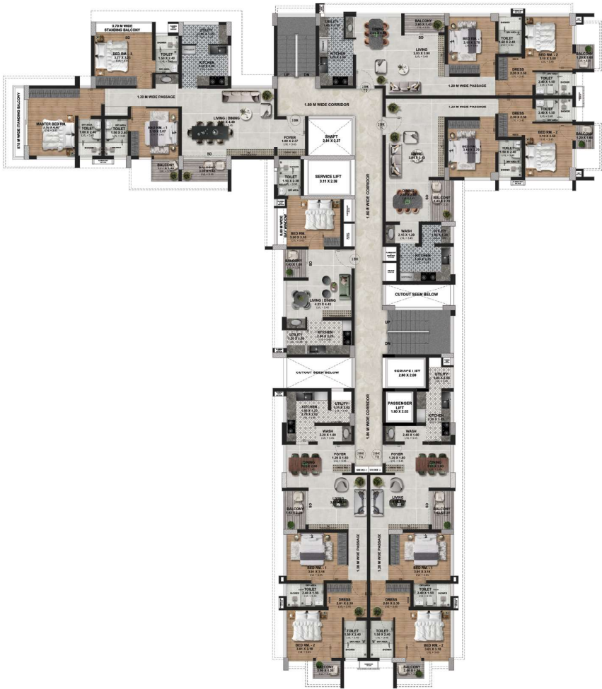
1 ST - 9 TH FLOOR PLAN BBC - ATLANTIS